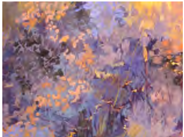
Pat San Soucie Once Upon an Orchard Clackamas, OR $1,200