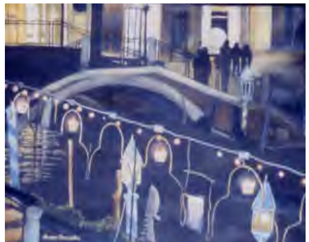
Bruce Chandler Venetian Night Charlotte, NC $800