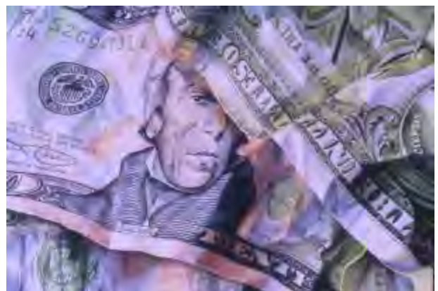
Laurie Humble Houston, TX Face Value? $3,000