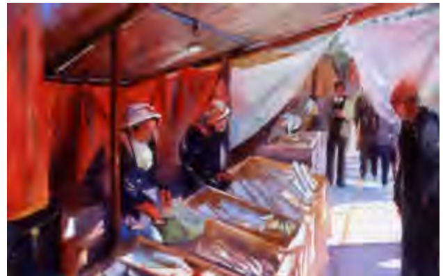
Keiko Tanabe Under the Shrine Gate San Diego, CA $1,150