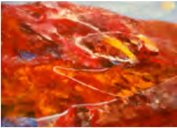
Tom Poole, LWS Ridge Roads Kentucky $795