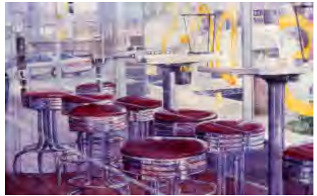
Carol Morgan Newkirk, OK Looking in Through the Corner Windows $1,500