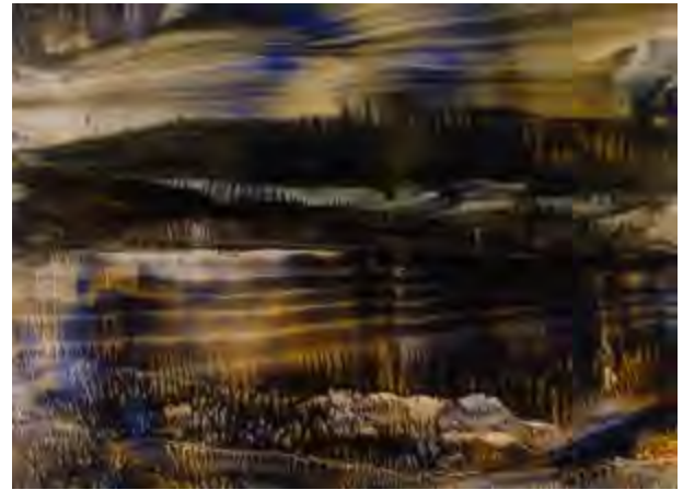
Sheila Cappelletti Storm Watch Sunnyside, NY $425