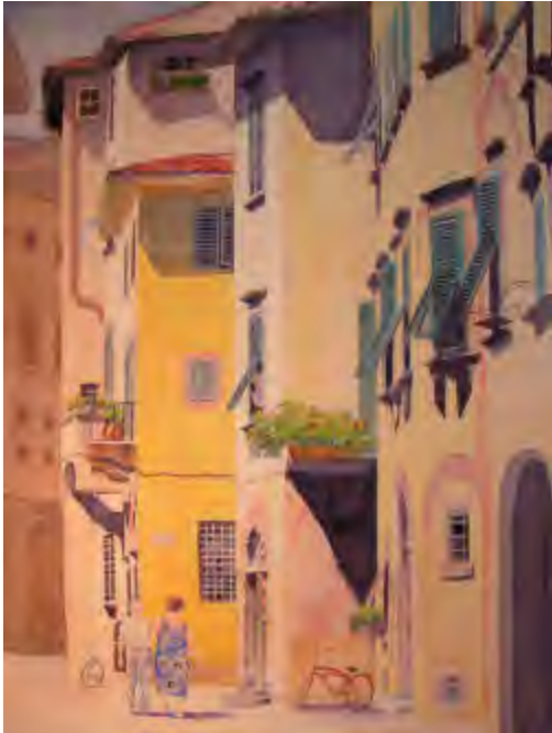
Debbie Cannatella Caminarre Lucca Oak Park, IL $1,200