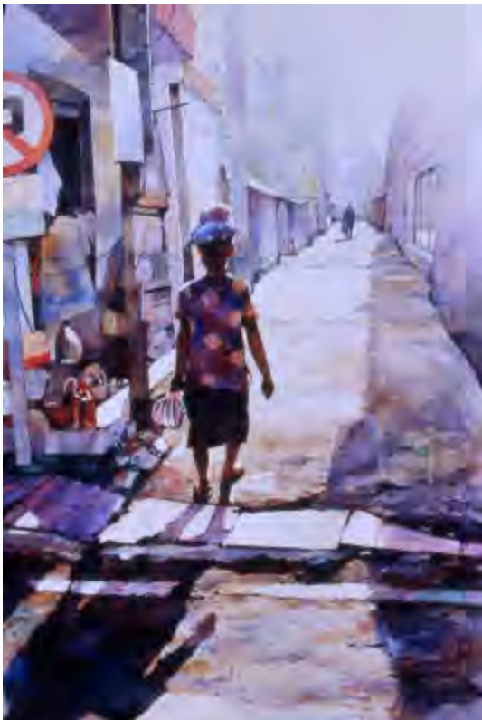
Jansen Chow Early Morning Light Malaysia NFS