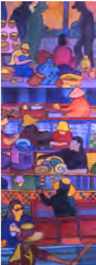
Charlotte Huntley, LWS Lafayette, CA Gridlock $2,000