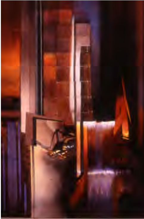
H.C. Dodd, LWS Houston, TX Blues II $2,250