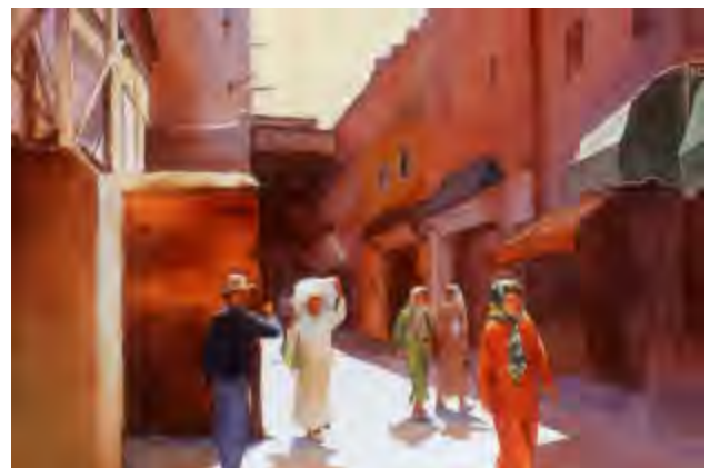
Pat Dispenziere Homeward Bound Poway, CA $2,000