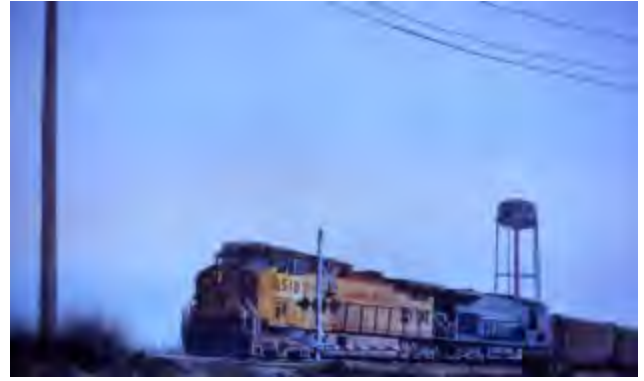
Graydon Cafarella, LWS 6518 at Rochelle, IL Glenwood, IL $600