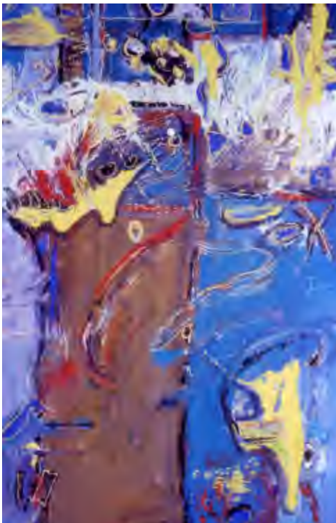
Toni Elkins Columbia, SC I Wish I Were a Bluebird $1000