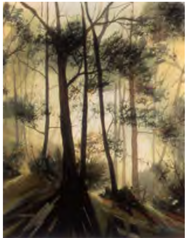
Pio Lyons New Orleans, LA