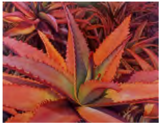
Eileen Mueller Neill Riverwoods, IL Aloe Garden $2,300