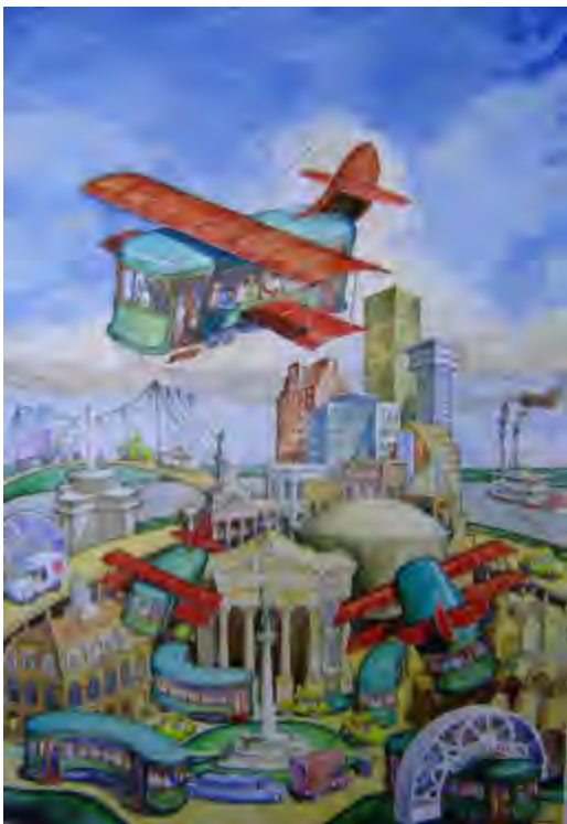
George Stanley Flying Streetcars Slidell, LA $1,500